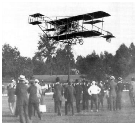
Genesee Valley Airfield