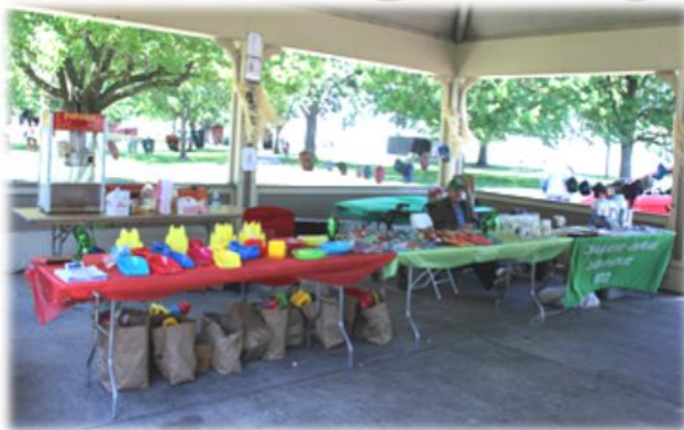
The CCA and Lighthouse tables