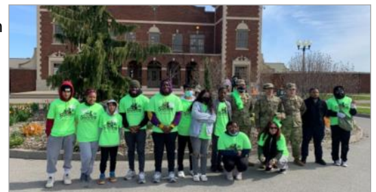
Leadership Academy for Young Men & Early College Preparation High School's Army JROTC program volunteers