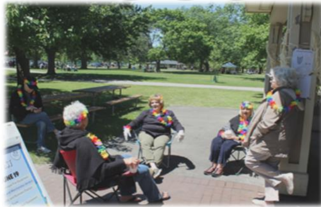
Our dedicated volunteers awaiting visitors

To honor this year's Bicentennial of the Charlotte-Genesee Lighthouse , the Ontario Beach Park Program Committee conceived and commissioned the sculpture with support from these sponsors: