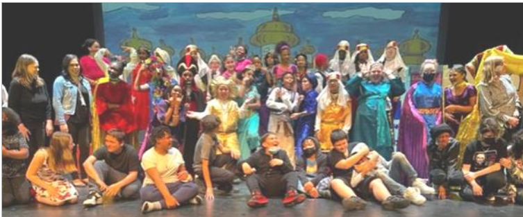
(Above) May 17, 2022 School 42 performed Disney's Aladdin Jr at School of the Arts, since out gym and stage are still under construction. The students sang beautifully and the stage crew transformed the stage into Agrabah, the city Aladdin lived.

person things we have done since before the pandemic." The school also had their gym under construction but that did not stop the students from acting in a play and performing in a Choir and Band for their parents.