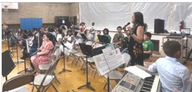
(Above) June 9th, students hosted its first in person choir and band concert in two years! The students sang like angels. (Below) The band played beautifully. It was a packed house in the gym and wonderful to see all the families come out and support their children.