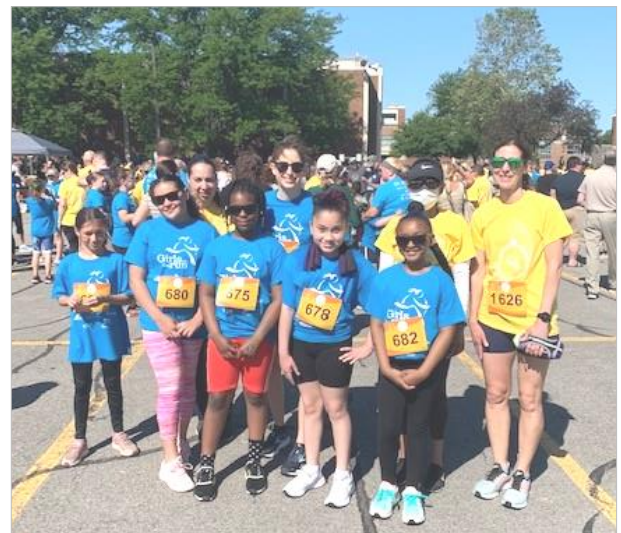
(Above) On June 5th the Girls on the Run team from school 42 participated with all the other Girls on the Run teams in Monroe County at MCC. The young ladies had worked hard and everyone finished the race. Teachers ran as buddies with girls i was a powerful morning.