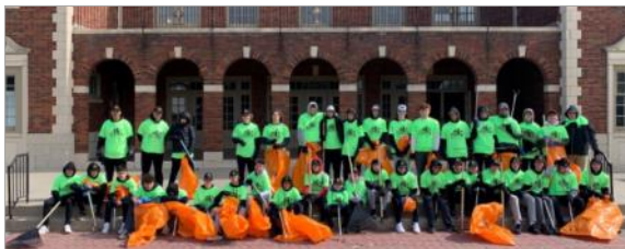
Greece Athena High School baseball team.

Great Job and we look forward to working together next year!