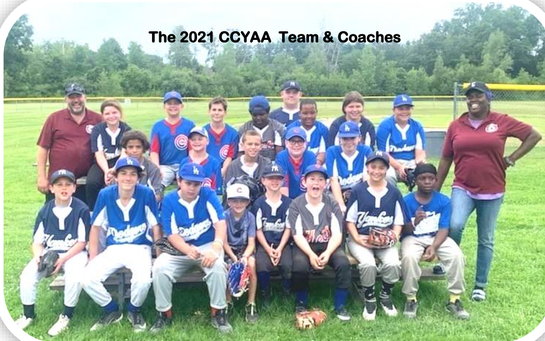
The 2021 CCYAA Team & Coaches

If are interested in making a donation, our address is: CYAA PO Box 12524 Rochester, NY 14612 We are a Federal and NYS recognized 501c3 and all donations are tax deductible. Please visit us on Facebook or our website www.cyaa-baseball.com .