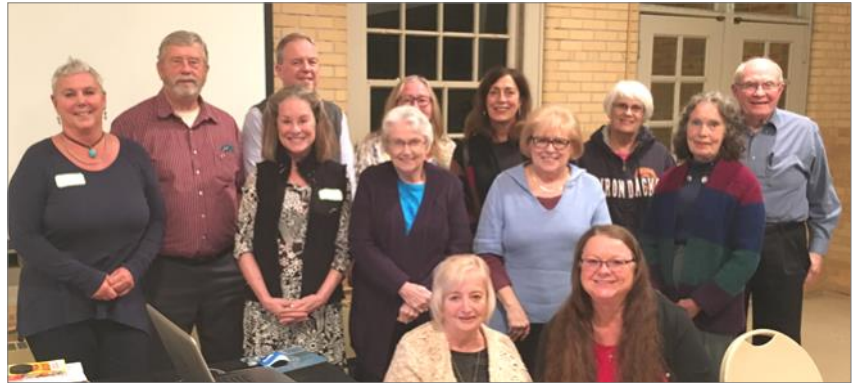
The CDC Steering Committee

Comments and ideas are welcome at: infocharlottecca@gmail.com .