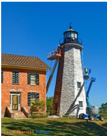
Masons brush on lime-wash to restore the original exterior finish of the Lighthouse Tower that will also preserve its masonry construction.

The Charlotte-Genesee Lighthouse Historical Society “keepers” of our lighthouse, the nation’s oldest surviving lighthouse on Lake Ontario, received a 2016 Landmark Society of Western New York “Award of Merit” at a special ceremony at City Hall on November 13 th . The Lighthouse Society was recognized for meticulously restoring the 1822 lighthouse tower and 1863 keeper’s dwelling to their original 19 th century appearance, using documentation drawn from a wide variety of local and national resources under the guidance of Bero Architecture PLLC in coordination with the National Park Service.