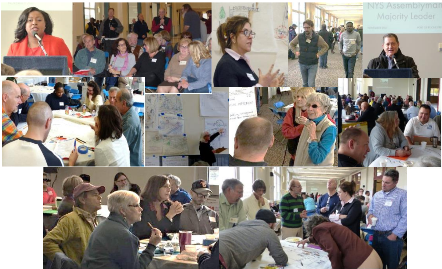
Charrette

http://www.charlottecca.org/community-development/charrette-process/ . You can also become involved in the CCA's ongoing Community Development Committee by contacting infocharlottecca@gmail.com .