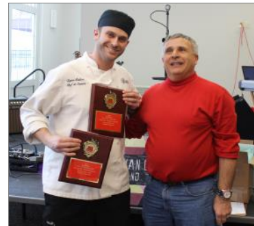
Aramark - University of Rochester 1st Place Professional + Peoples Choice Awards