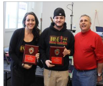
Hose 22 2nd Place Professional + Best of Charlotte Awards