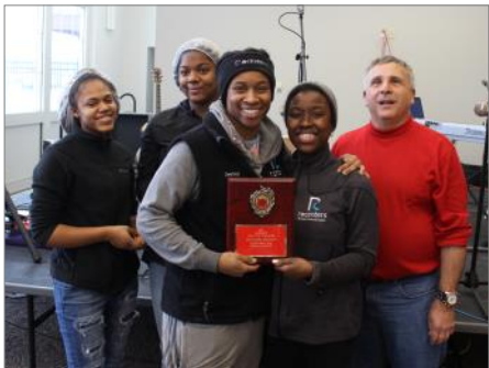
Humboldt Team 2nd Place Amateur Award