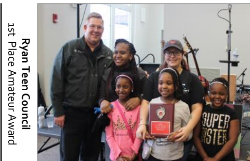
Ryan Teen Council 1st Place Amateur Award