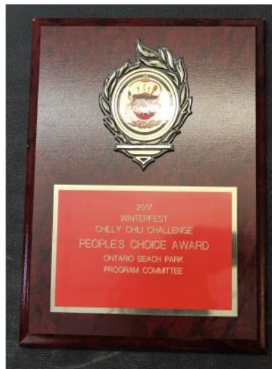
The Peoples Choice Award