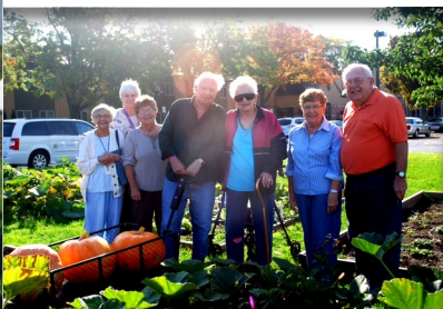
Proud Growers of the Beatrice Place Community Garden