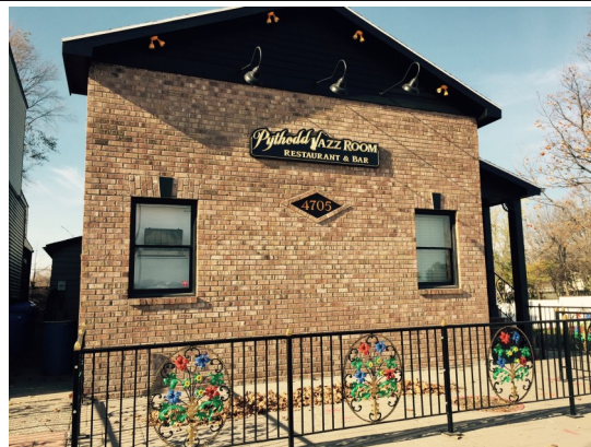
Welcome to the new Pythodd Jazz Room located on Lake Ave and Hinchey St.